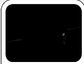
Handle with lock