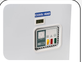
Digital control panel with alarm