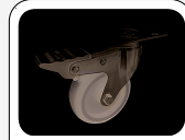
Castor included in the packaging (To be assembled)